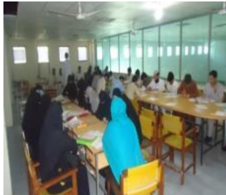
Workshop on Violence Against Women & Education 2015