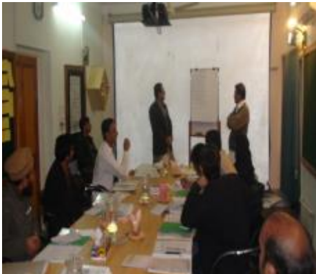
Workshop on Poverty Elimination and Income Generation Scheme