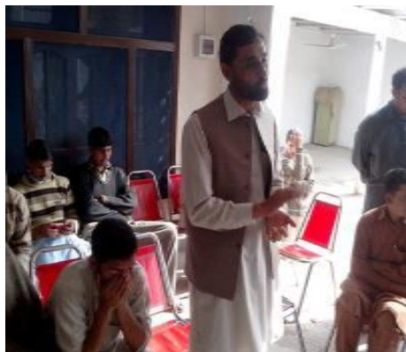
Seminar on Violence against Women, Crime, Education & Technical Skills