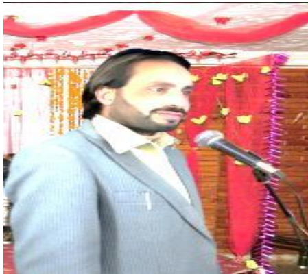
Seminar on Juvenile Delinquency, Crimes & Poverty Elimination & Education in Malakand 2019