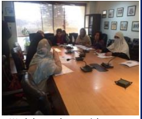
Workshop on human rights on violence against women base