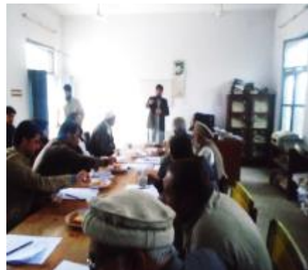
All District NGO Members Meeting in Malakand