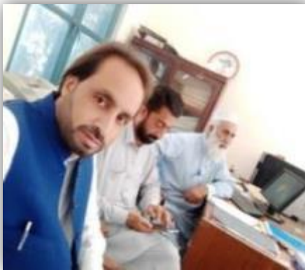
Meeting with All District NGO Members Malakand