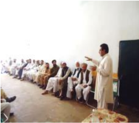
Seminar on Peace, Community Development, & Technical Skills