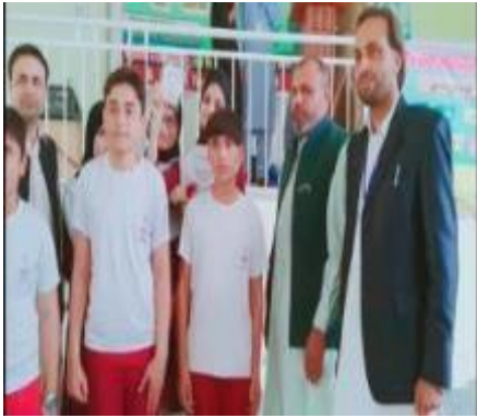
All District Inter-Schools Competitor on 28 th September 2020-21