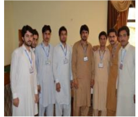
Master Trainers Group Photo