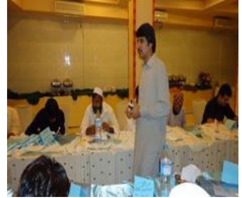
Workshop on Education & hygiene in Malakand 2016