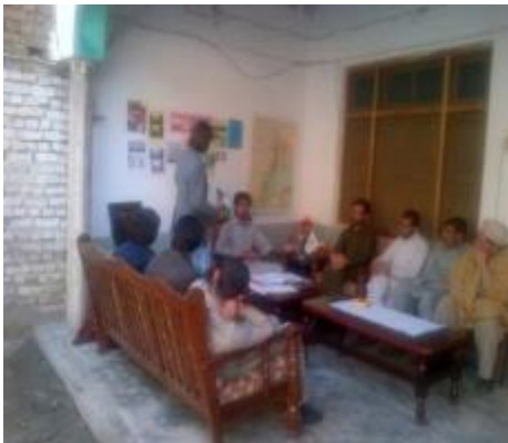
Community Meeting on Education & WASH in Batkhela at Malakand 2017