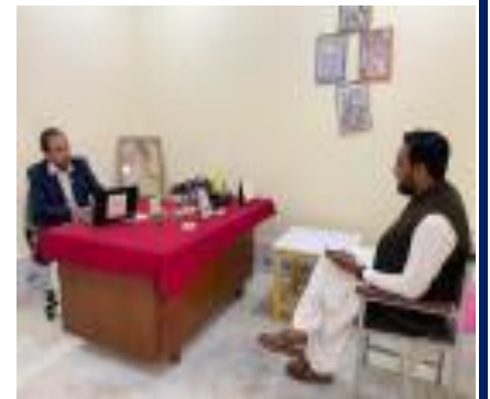
Distt: Youth Officer visit our office