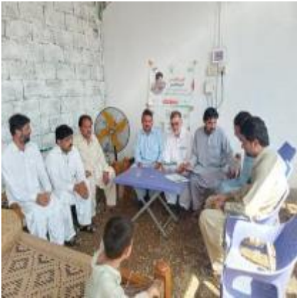
Coronavirus (COVID-19) Vaccinations Awareness CBOs meeting