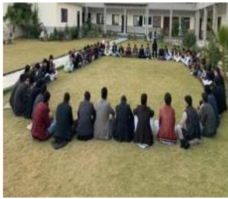
Seminar on Leadership to the Master trainers