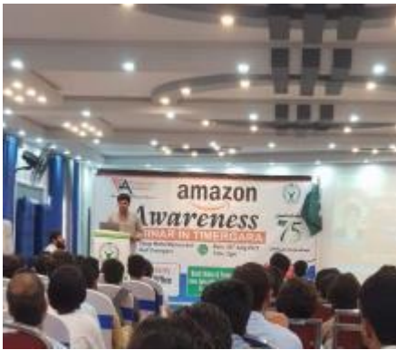
Seminar on Freelancing/amazon awareness in 2022