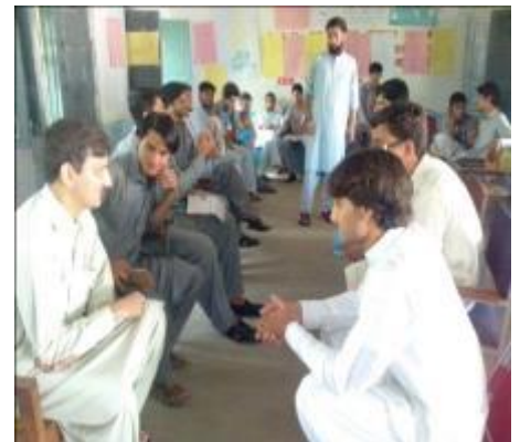
Junior Trainer Workshop on Child Education in Malakand 2018