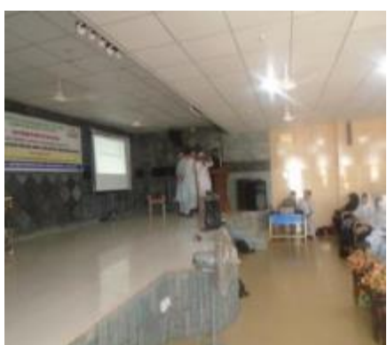
All Malakand Division Members NGO Workshop in Swat