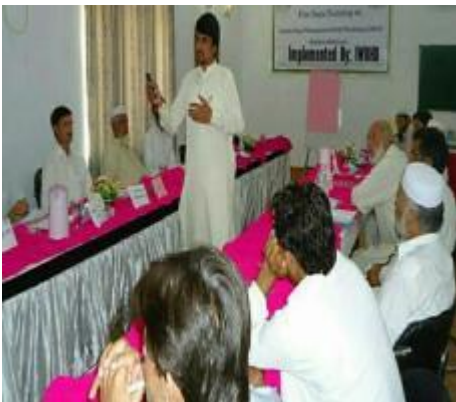
Seminar on Human Rights & Education