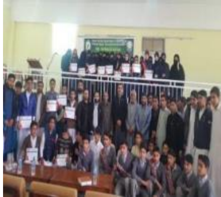
Seminar on Professional Ethics & Confidence Building March 2021