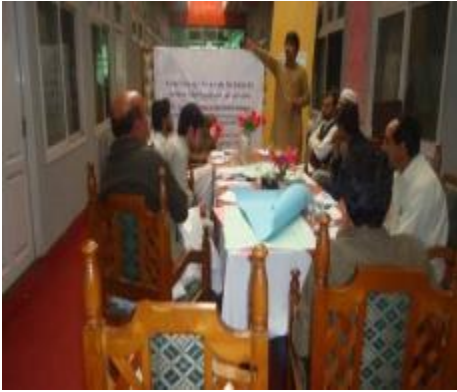
Four Days Workshop on Community Facilitation & Village Development Plan