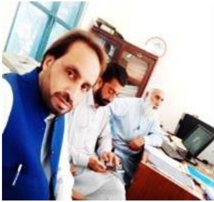
Meeting with All District NGO Members Malakand