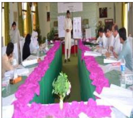
Workshop of Master Trainer on Teaching Methodology