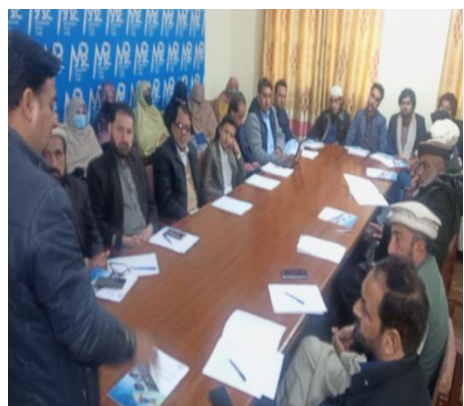
Seminar on Transparency of Budget