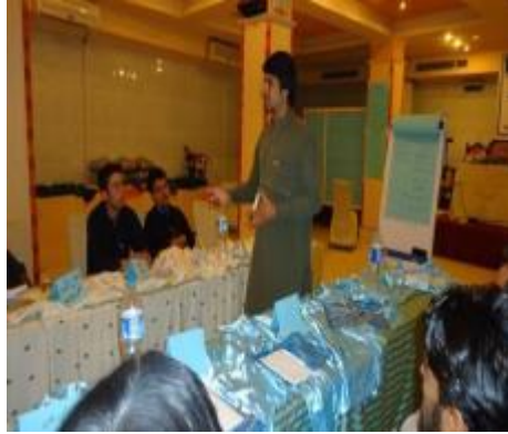
Workshop on Poverty Elimination, and the importance of Technical skills