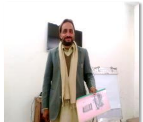
Meeting with City President & District Youths (Sport & Culture) in October 2018