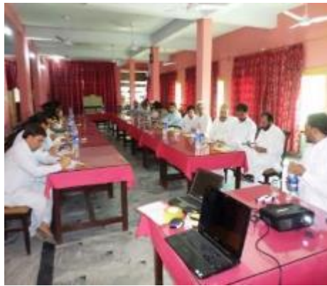
Two days' Workshop on Human Rights on Gender Disparity & Education