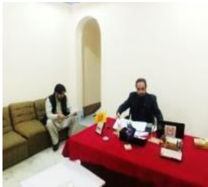
District Social Welfare Officer Visit our Head Office (Organization Office)