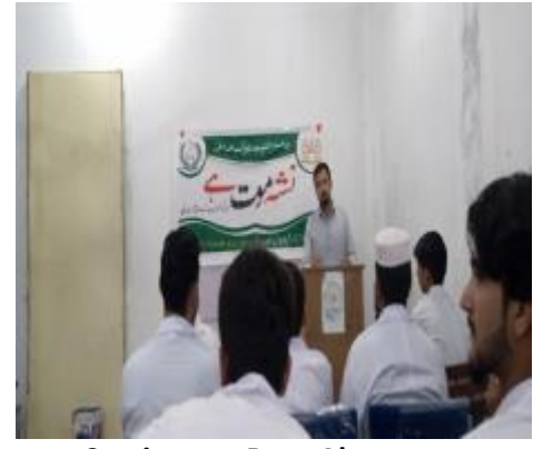
Seminar on Drug Abuse