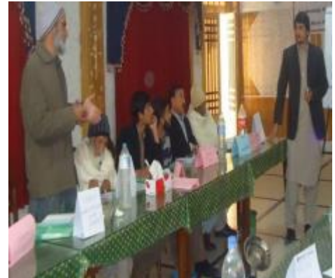
Workshop on Child Education & Child Protection in Malakand 2016