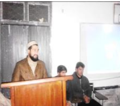
Seminar on Career Counseling & Education in Batkhela