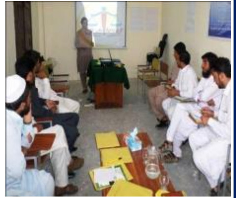
Workshop on Voter Education 2015