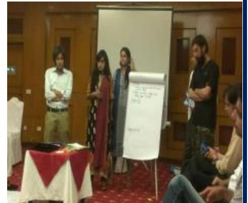
Master Trainer Training Workshop on ILM-Possible Take A Child To School