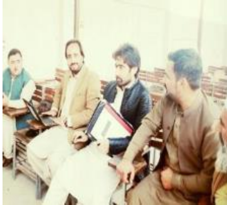
Community Meeting on Child Education