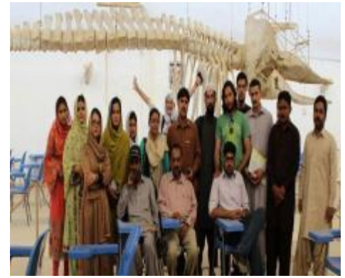
Group Photo After Training session on Child Education in Islamabad