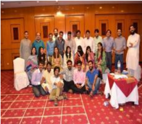
Group Photo After Training session, in Child Education in Islamabad