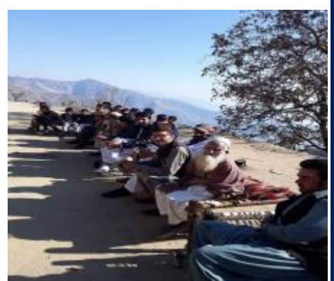
Seminar on Agriculture & Agro based Industry