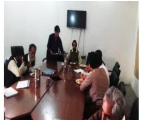
All Union Councils CBOs Presidents meeting to Discuss Community Problems 15/03/2018