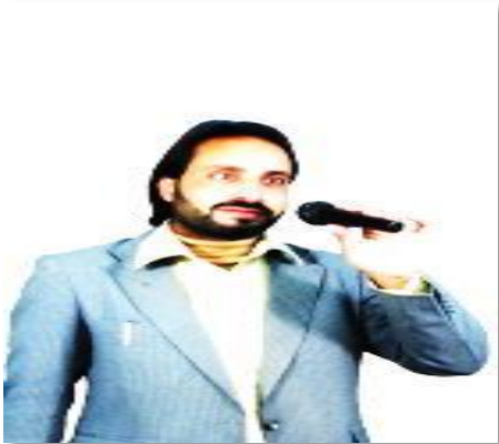
Education Social entrepreneurship/women Empowerment 2019