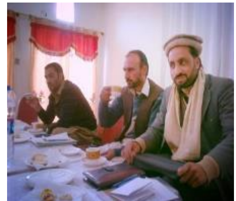
Five Days Training of Community Resource Persons (CRPs) 15-20/01/ 2018