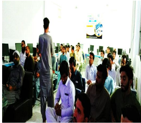
Seminar on Freelancing