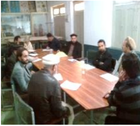
All District NGO Presidents/Executive Directors Meeting in 10/01/2018