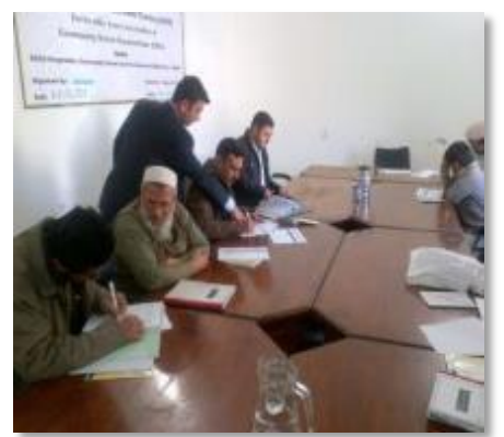
Five Days Training on Leadership Management Skill Training (LMST) in 02-07/03/2018