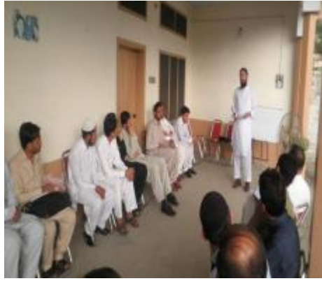
Seminar on Child Education (ILM- Possible Take A Child To School)