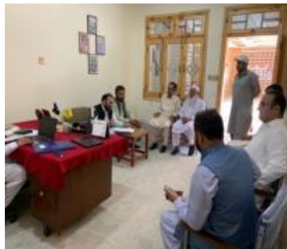
Meeting with Cabinet Members , DO SWO & District Youths Officer Visit our Head Office (Organization Office)