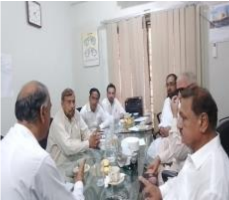
IWOHD Cabinet Meeting