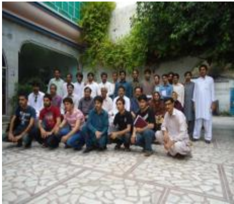
Group Photo of Male & Female Master Trainers After Training on Human Rights, Gender Disparity & Education in Peshawar June 2014

IWOHD has conducted different types of studies (Survey) individually and organizational level with different nations and INGO's. Some of them the IWOHD has developed its own design and implemented e.g.