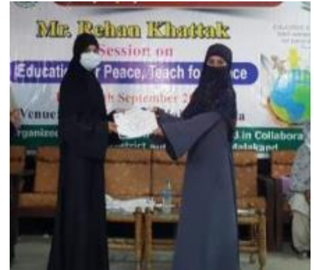
Seminar on Education for Peace, Teach for Peace in 2021