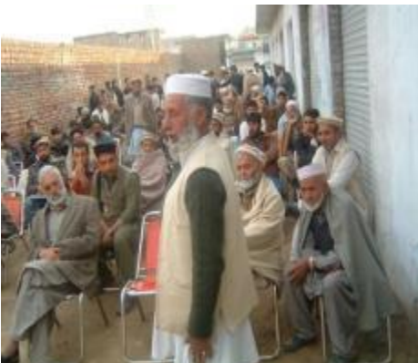
Seminar on Voter Education