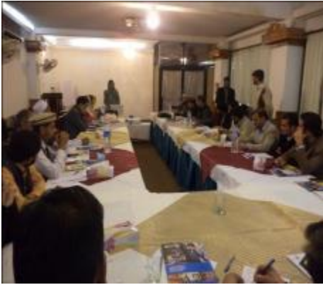
Workshop on Child Education (ILM-Possible Take A Child To School)