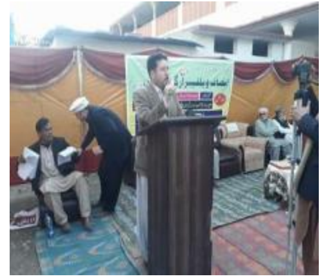
Seminar on Education and Distribution of School Kits 2020